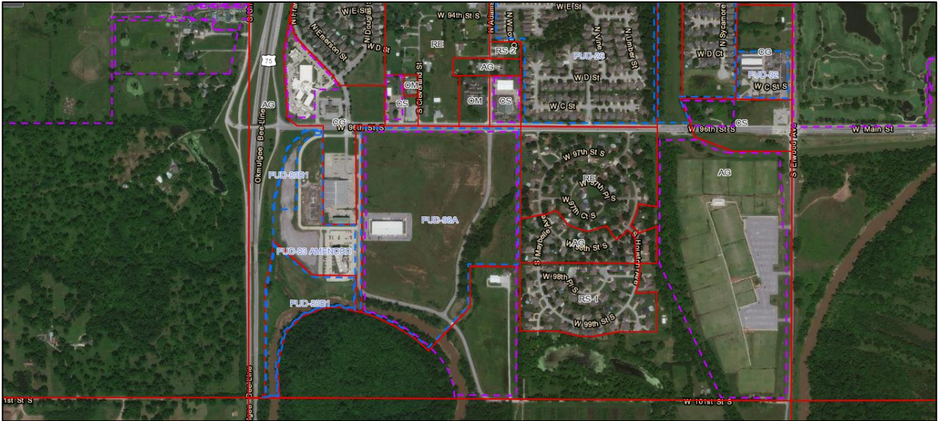
Figure 2: Zoning Map | INCOG